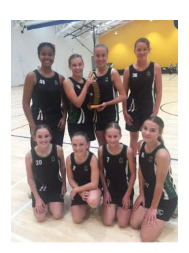
Year 7-9 Girls' Basketball side