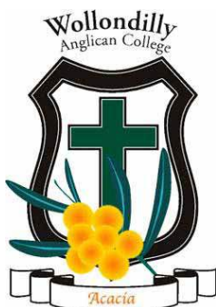
ACACIA | GOLD

The Houses compete against each other in Swimming, Athletics and Cross Country Carnivals each year, as well as other non-sporting competitions.